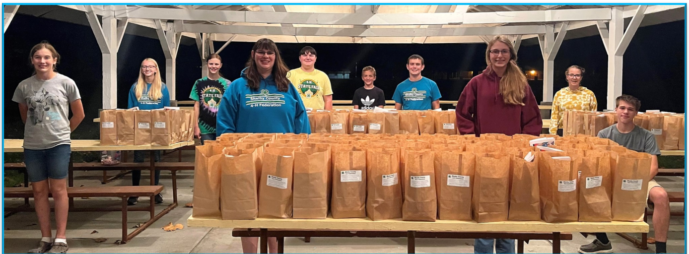
Federation packed 300 harvest bags