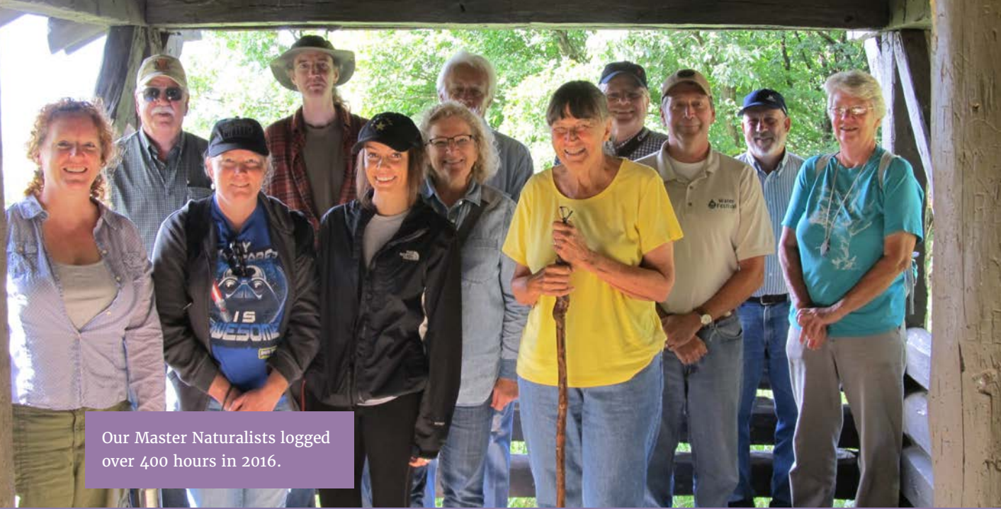
Our Master Naturalists logged over 400 hours in 2016.

Volunteer work continues with a number of organizations and agencies including the US Fish & Wildlife Service (Two Rivers NWR and Illinois River National Wildlife and Fish Refuge Complex), Tree House Wildlife Center; McCully Heritage Project, Jim Edgar Panther Creek State Fish & Wildlife Area, Friends of the Sangamon Valley, and Trees Forever.