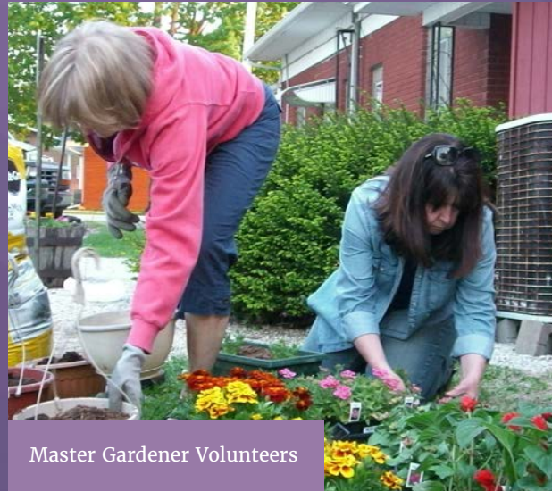
Master Gardener Volunteers

Our Master Gardeners have given back to our communities by providing educational opportunities and working on numerous projects including the work at the Jacksonville Library Children’s garden, the establishment of Monarch Waystations, as well as education regarding Monarchs and milkweed plants. Work also continues in collaboration with the Salvation Army, the Duncan Mansion, Prairieland Heritage Museum, Jacksonville Public Library, area Farmers Markets and other community projects throughout the unit.