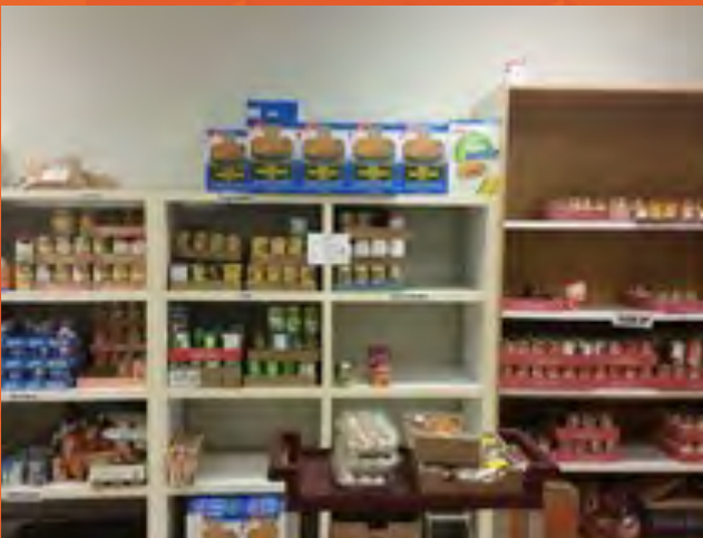
Shown is the Shumway Freedom House Food Pantry shelves.

The University of Illinois Extension's SNAP-Education program partnered with Catholic Charities and Shumway Freedom House Food Pantry this year in order to complete the Nutrition Environment Food Pantry Assessment Tool (NEFPAT). This tool allows Extension staff to help food pantries in identifying current best practices and potential opportunities to enhance the emergency food environment. Areas include increasing client choice for nutritious options, marketing & nudging healthful practices, providing various types of fruits & vegetables, promoting additional community resources, and plans for alternate eating patterns. SNAP-Education Extension Educator, Michelle Fombelle, assisted collaborating pantries in ways to improve their score and providing resources for their pantry.