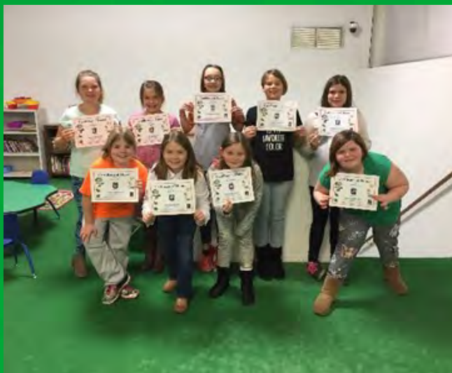
Pictured above are 9 of the 15 participants in the 5 week YMCA Cooking School .

Fayette County 4-H partnered with the Fayette County YMCA to host a five week youth cooking school in November and December. The 15 participants, ages 8-13, learned about food safety and preparation techniques, whole grains, fresh fruits and veggies, lean protein, and calcium-rich foods. Each week the students prepared their own snack and took home recipes to try.