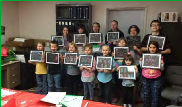
Above, 14 attendees of the Winter Craft Workshop held in Fayette County, show off their chalk art.

The holiday season often includes making gifts and treats to share with others, and that is just what Fayette County 4-H youth did on December 9. The 14 participants decorated coffee mugs, made chalk art, and enjoyed hot chocolate while decorating Christmas tree brownies.