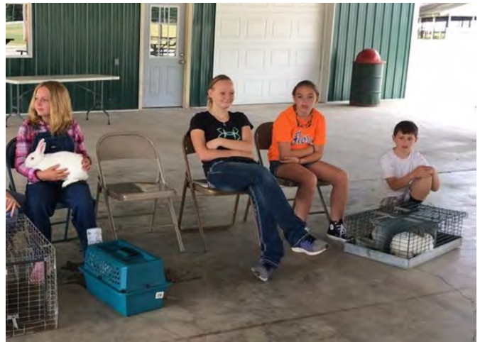
Above, 4-Hers attend a Rabbit Workshop on June 17 in Clay County.

The Clay County 4-H hosted a Rabbit Workshop on June 17 at the Clay County Fair Grounds. Ten youth attended this workshop to learn more about their rabbits dietary needs, care and handling of their animal and expectations for the day of the rabbit show. The workshop wrapped up with a time for questions participants might have. This workshop allowed for youth to develop a better knowledge of their 4-H projects.