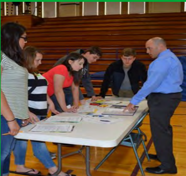
May 2, 2017. Brownstown High School seniors (41) participated in the Welcome to the Real World

At the conclusion of the activities, students evaluate how well they spent/saved their money. They consider the choices they made and discuss what alternatives might be taken in the real world.