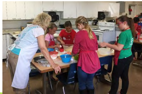
Fourth graders from the Ramsey Grade School are shown above during the 6 week Cooking School.