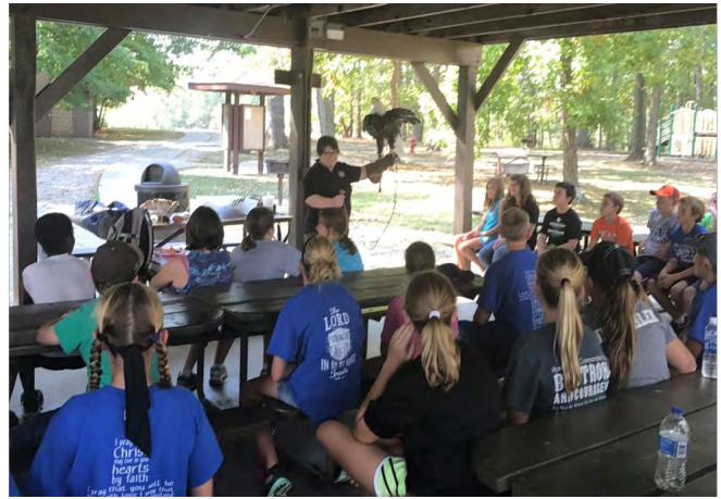
Above, children gather to see the eagle during Jasper County Conservation Field Day.