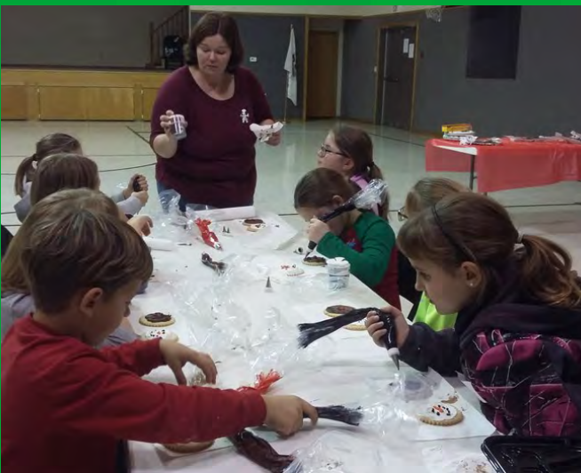
Above, children participate in Jasper County Afterschool Adventures.

The Jasper County Extension organizes each session and experienced local volunteers present the subject matter. Jasper County 4-H Ambassadors and Federation members also assist the youth with the various sessions developing leadership skills. Over 250 youth participated in the Afterschool Adventures program this past year. Sessions included cooking, drones, and visual arts; painting and crafts.