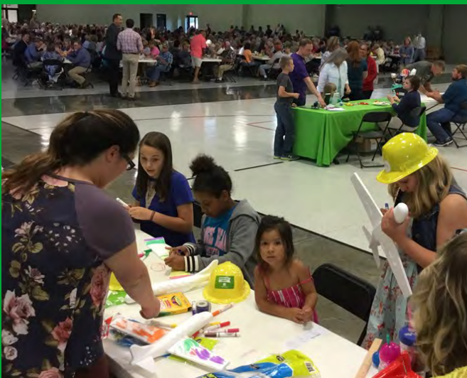
Above, children decorate drones before attaching the camera in preparation for flight.

Clay County had several local organizations interested in a drone activity presented at various events over the past year. The Clay County Electric Annual Meeting was held on August 24 where Extension Staff hosted a drone activity for around 40 children. The children were able to make and decorate their foam airplanes or "drones", attach the camera and fly their airplanes outside. After they had flown their drones they were able to watch the video of their drones in action. This activity was also presented for the Clay County Hospital Health Expo on October 14 where around 20 children participated.