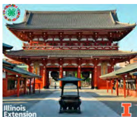
Travel Abroad Update!

National 4-H Council is now accepting presentation proposals from adult and teen presenters for the 2022 National 4-H Youth Summit (N4-HYS) on Agri-Science to be held in the Washington, DC area, March 10-13, 2022 . High school-aged youth are immersed in an agenda focused on agricultural science, food security and sustainability. Sessions will demonstrate why and how agriscience is important and how young people can become changemakers. Find general conference information at https://4-h.org/parents/national-youth-summits/ . Full details available here and submissions are due by October 3 rd !