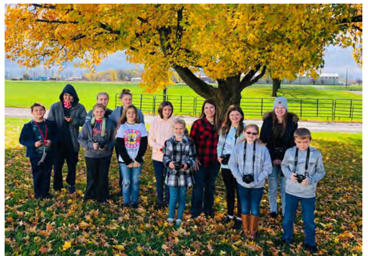
4-H Outdoor Photography Workshop Fun on Nov 11!