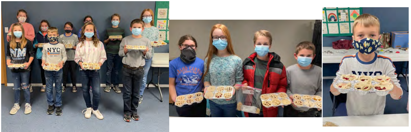
4-H Mini Pie Baking Workshop Held on Nov 23! Great job Everyone!