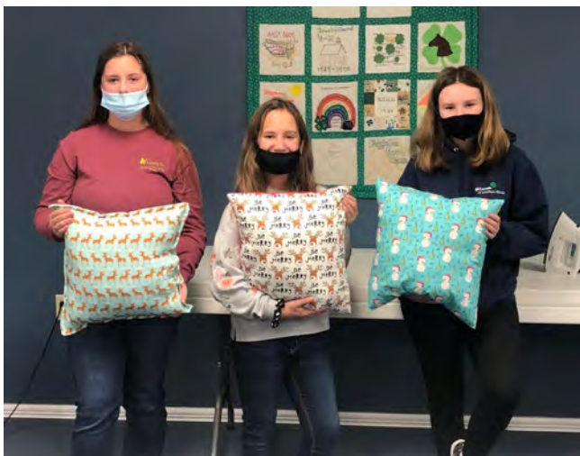
4-H Holiday Sewing Workshop on Nov 20!