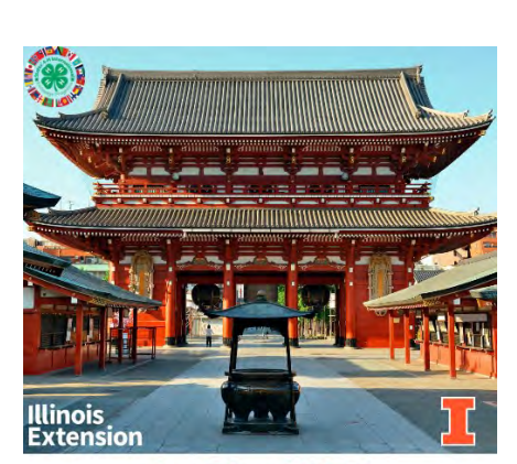
Travel Abroad Update!