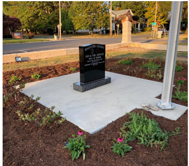
Macoupin County Master Gardeners completed the First Responders Memorial landscape located near the historic Macoupin County courthouse in Carlinville, Illinois.

go.illinois.edu/EverydayEnvironmentWebinars