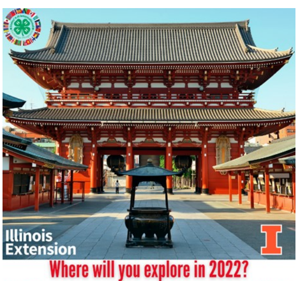
Costa Rica · Japan · Korea · Norway · Finland ·Romania · Taiwan · Argentina

RECRUITMENT PERIOD: September-November <u>https://www.states4hexchange.org/apply/go-abroad/</u>