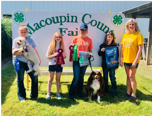
DOG SHOW 2022

extension.illinois.edu/cjmm/4-h-macoupin-county