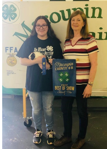
Small Pets 2022