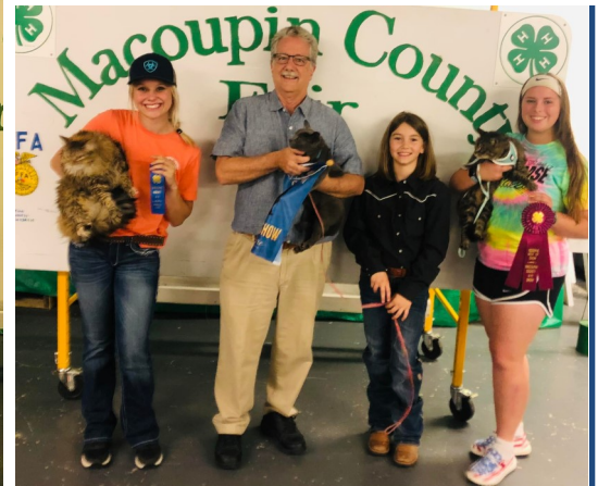
Cat Show 2022