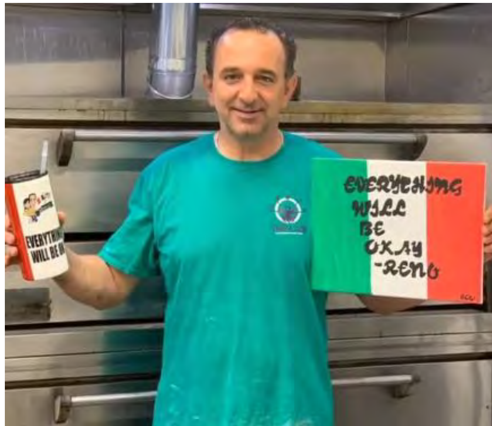
Reno Lentini Reno's Italian Pizzeria & Ristorante