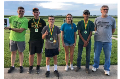
4-H Shotgun Members