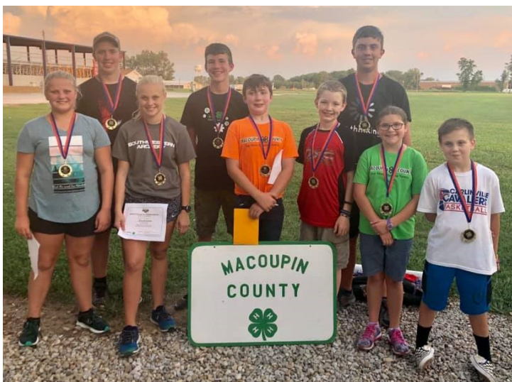
County Shoot Top Archers