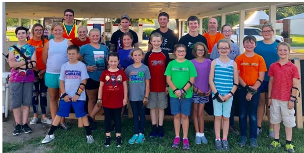
4-H Archery Members