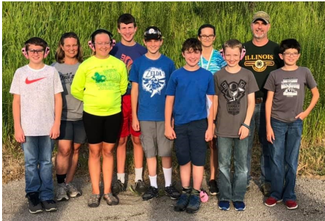
4-H Rifle Members

extension.illinois.edu/cjmm/4-h-macoupin-county