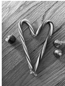
Cloverbud 2nd: Madelyn Cloninger (Below)