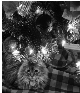
3rd: Wyld Gilmore