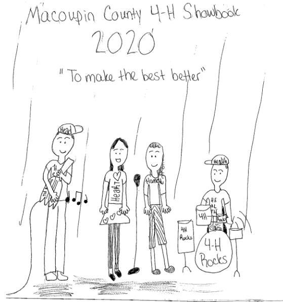
by Cara Wunningham