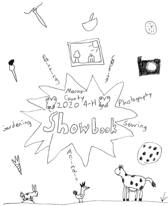
3 rd Place: Nola Reid, 4x4's