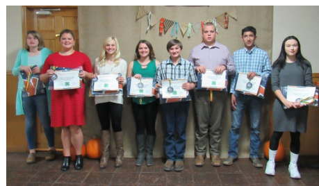
4-H Emerald Clovers