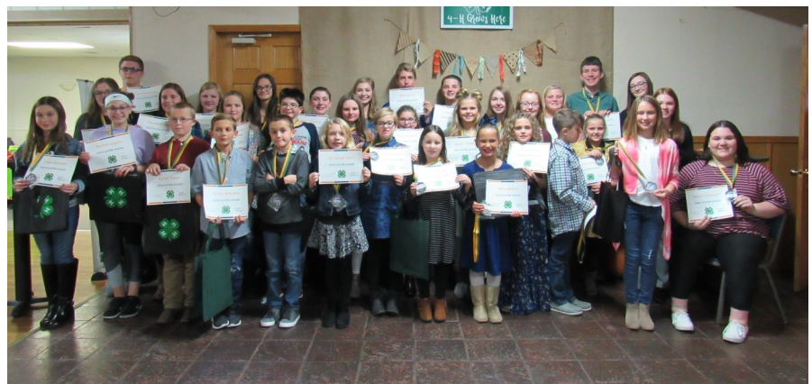
4-H Gold Clover Award Winners 2019