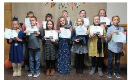
4-H Rookies of the Year