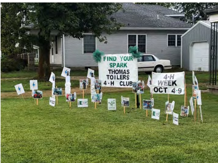
Thomas Toilers—W North Ave, Flora