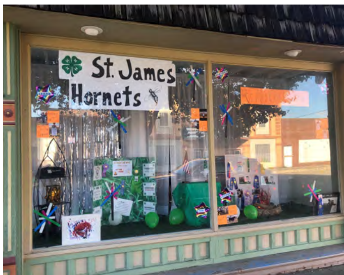
St. James Hornets—The Table, St. Elmo

Winners will be announced at the Achievement Celebration.