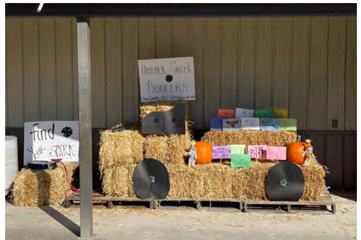
Panther Creek Pioneers—Zink's