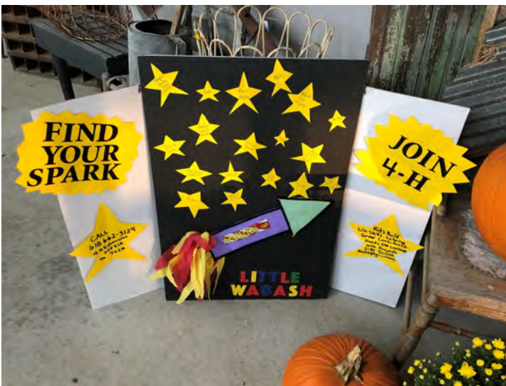
Little Wabash Deer & Fawn—Mustard Seed

Winners will be announced at the Achievement Celebration.