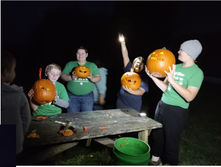
Leaf River Soaring Eagles 4-H Club has Saturday Apirit Cly Style for National 4-H Week!