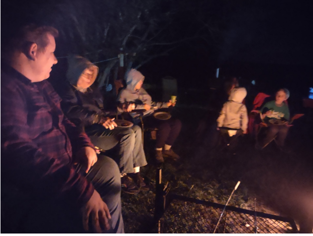
Leaf River Soaring Eagles 4-H Club held a Kick-Off Party on October 7!