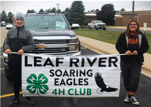
Leaf River Soaring Eagles participated in AOP in October.