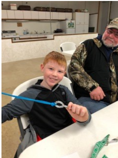
Winter Fishing Clinic knot tying activity