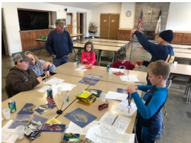
Sportfishing SPIN Club gets underway