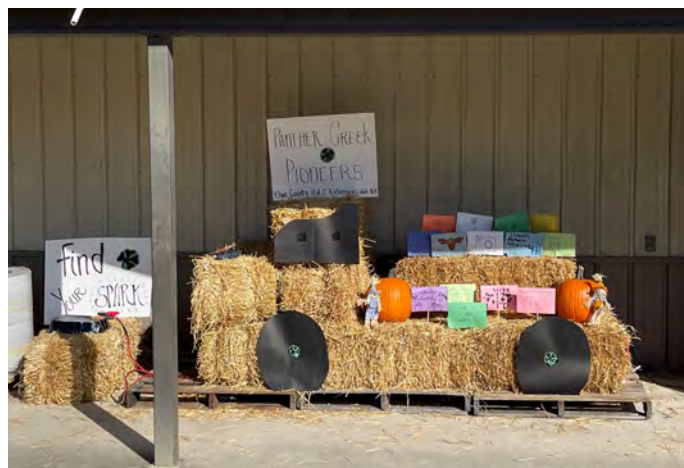
Panther Creek Pioneers—Zink's