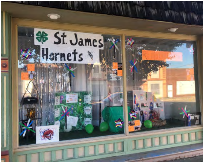
St. James Hornets—The Table, St. Elmo

Winners will be announced at the Achievement Celebration.