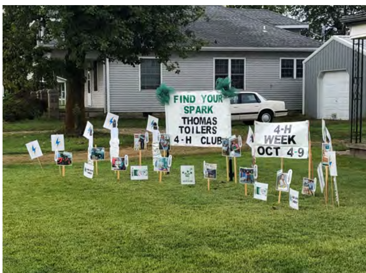
Thomas Toilers—W North Ave, Flora