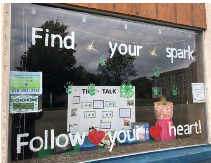
Ramsey Seniors & Senioritas—Ramsey News Journal