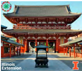
Travel Abroad Update!

National 4-H Council is now accepting presentation proposals from adult and teen presenters for the 2022 National 4-H Youth Summit (N4-HYS) on Agri-Science to be held in the Washington, DC area, March 10-13, 2022 . High school-aged youth are immersed in an agenda focused on agricultural science, food security and sustainability. Sessions will demonstrate why and how agriscience is important and how young people can become changemakers. Find general conference information at https://4-h.org/parents/national-youth-summits/ . Full details available here and submissions are due by October 3 rd !