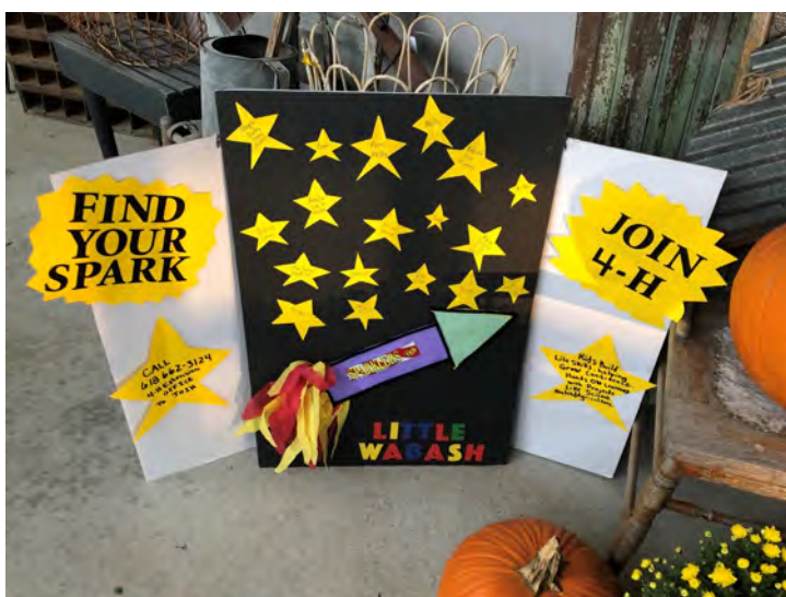
Little Wabash Deer & Fawn—Mustard Seed

Winners will be announced at the Achievement Celebration.