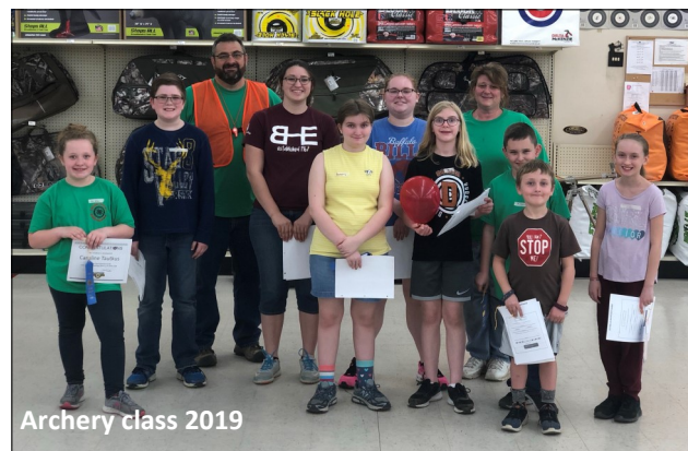
Archery class 2019

DATE: Saturday, February 29, 9 am - 12 pm COST: $15.00 supply fee payable to U of I Extension (includes supplies for a completed item, extra fabric, etc.) LOCATION: U of I Extension Peoria office TO REGISTER: Call the Extension office at 685-3140 or go online: https://extension.illinois.edu/events/2020-02-29-beginner-sewing-workshop