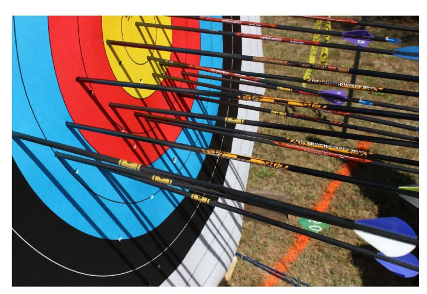
4-H Shooting Sports Certification Training October 19 | 4-H Memorial Camp, Monticello