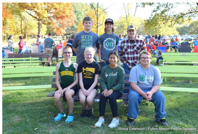
Federation members at Fall Celebration

Sixty-four 4-H members were honored at the Fall Celebration Event held at City Kids Camp on Saturday, October 22. Project awards, Best of Species, Best of Non-Livestock, Outstanding First Year Members, Hilda Rock Memorial Cooking Award, "I Dare You", Club Community Service, Best Head of Five Cattle, Secretary, Treasurer, and Reporter of the Year were all awarded to deserving 4-H members. The Fulton County 4-H week window display participants, and the Jo Ann Block and Diane Simons Memorial award winner were also recognized. 4-H, Master Gardener, and Master Naturalist volunteers were all honored and presented with a special Christmas ornament. After the awards ceremony, food and drink were provided for everyone by Illinois Extension-Fulton 4-H, City Kids Camp, and Fulton County HEA clubs for all in attendance. Gorgeous weather, good food, and great fellowship was enjoyed by all!