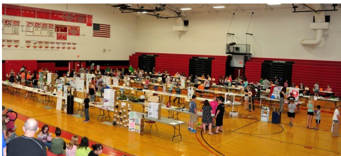
4-H General Show 2019

In the next two 4-H newsletters will be information on the summer 4-H shows, where members exhibit their projects. These are held on various dates, in various places. The 4-H Show Book will be available around April 1st, which will tell you what you need to exhibit for your project, where, and when. Last year's 4-H Show Book is on our website. It's a good reference, but some things will change, so be sure to look closely at your project requirements in the new book when it comes out. Always feel free to call the Extension Office with questions, 547-3711, or send an email to jblout@illinois.edu .