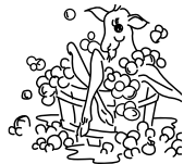
"Lather up with goat's milk!"