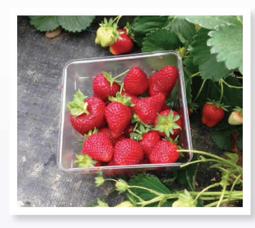
There is little better than the sweet juiciness of a strawberry picked from your own garden.

It is critical to plant strawberries at the proper time (in Illinois, that means April if soil conditions allow) and the