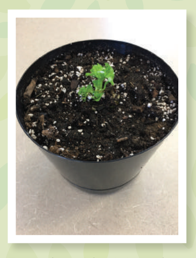
The start of regrowth from the bottom of a celery stalk.

Growing plants from leftovers can be fun and rewarding, but the process does take some patience. Realize that commercial production of vegetables and fruit involves complicated processes (like grafting) and that what we regrow at home may not match the aesthetics of what is in the store. Hopefully, these green thumb experiments with plants will leave you wanting to try new things in your garden. Recycle, reuse—and regrow!