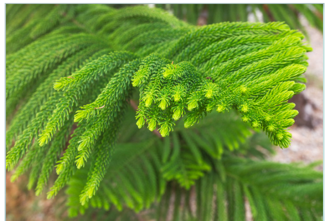
Norfolk Island pine plant.