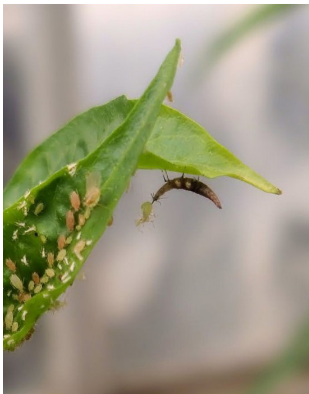
Green lacewing aphid.

Also called aphid lions, they can eat 40-60 aphids per day, using their large, curved, and hollow mandibles to grasp aphids and inject a paralyzing venom. The lacewing then extracts the juices of the aphid and throws the carcass to the ground. They may also go for other smaller-body invertebrates like caterpillar, beetle, scale, mealy bugs, leaf hoppers, thrips, and mites.