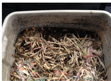
Worm compost bin.

Start with an opaque ten-gallon tote and drill about forty 1/8" – 1/4" holes on top of the lid. Next, fill the bin half way with shredded newspaper (no larger than 1/2" strips) and mix in water until the paper has the consistency of a rung-out sponge. Then add a handful of soil from the earth. Lastly, add one pound of squirming worms (approximately 1000 worms/pound). It is important use red wiggler worms ( Eisenia fetida ) because they can tolerate room temperature and do not need to burrow.