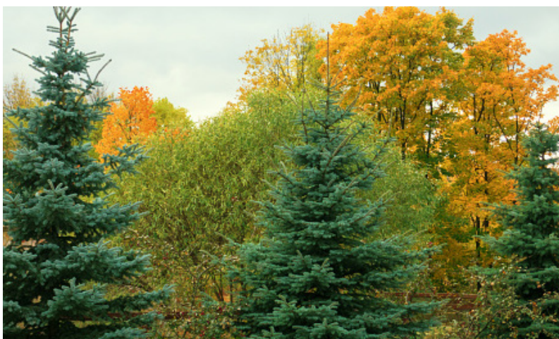
Evergreen trees do not go dormant in the winter.

Be sure to avoid fertilizer, so you don't stimulate any late-season growth, and consider applying mulch. Apply mulch about 2-4 inches away from the base of the tree all the way to the drip line in a donut shape. Mulch can help conserve moisture over the winter months.