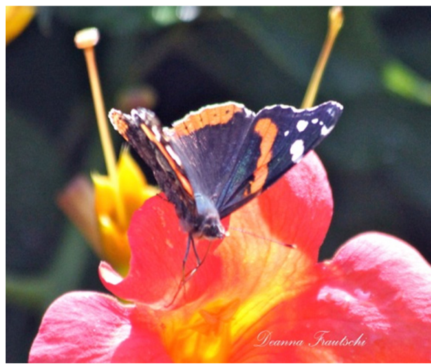
Red admiral butterfly.

Many moths and butterflies overwinter as caterpillars, pupae, and even adults, in the soil surface, leaf litter, amongst dead plants and twigs, and other hiding places in the garden. Adults of mourning cloak, comma, question mark and red admiral overwinter in tree bark, logs, and leaf litter. The pupae of swallowtails, sulphurs, and cercopia moths overwinter on dead plant stems or leaf litter. Caterpillars of red spotted purple, viceroy, Baltimore checkerspot and great spangled fritillary overwinter in dead leaves from the host plant. Purplish copper overwinters as eggs in debris. Eliminating a garden's protective layers means you may be unknowingly removing the visitors every gardener wants.