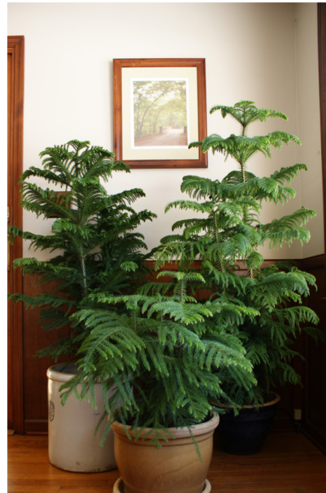
Norfolk Island pine is a commonly sold houseplant that many discard after the holiday season, but it can offer beautiful foliage year-round when given proper care.

With proper care, you can enjoy your Norfolk Island pine for many Christmases to come. In fact, they make a wonderful living Christmas tree you can reuse for years.