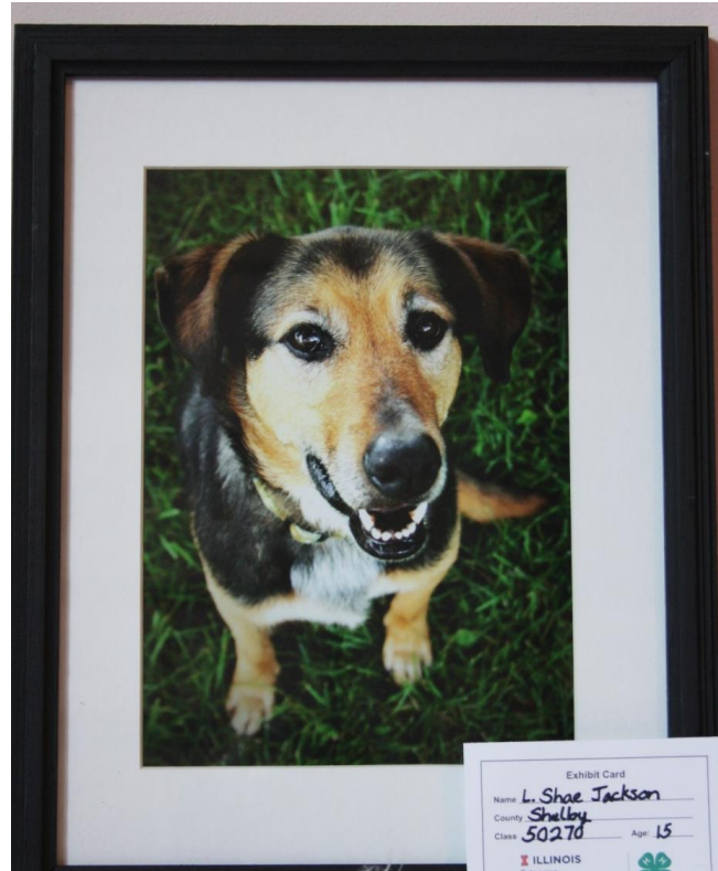
Photography 3 Champion – Shae Jackson