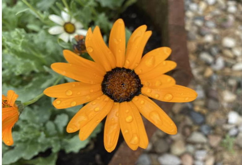
Photography 1 Champion – Audrey Durbin

Grand Champion Jr. Overall: Audrey Durbin