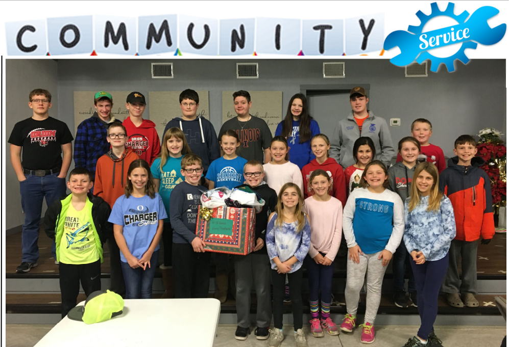
The Western Jr Farmers 4-H Club members collected and donated mittens, hats, gloves and other winter supplies to CR Hanna Elementary as part of their December Service Project.