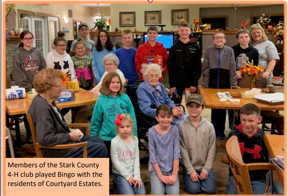
Members of the Stark County 4-H club played Bingo with the residents of Courtyard Estates.