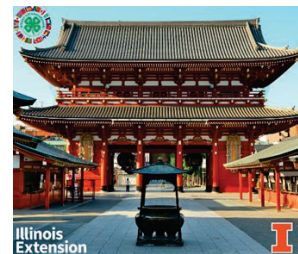
Travel Abroad Update!

Third and final payment Due April 15, when tickets are purchased.