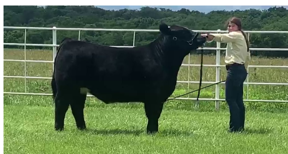
Reserve Grand Champion