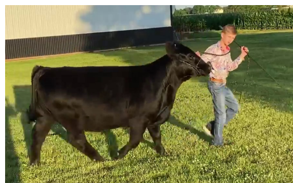
Reserve Grand Champion