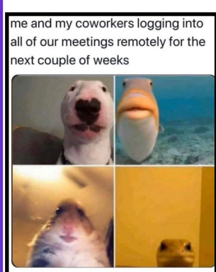
me and my coworkers logging into all of our meetings remotely for the next couple of weeks

Speaking of 4-H, would any of you be comfortable making a video to share in the group of a 4-H project. Perhaps making your favorite Cooking project or Sewing? Maybe prepping and working with livestock for the fair? How about a virtual farm tour of your farm? We'd love to see it. You can email it to me or post it directly to the private group!