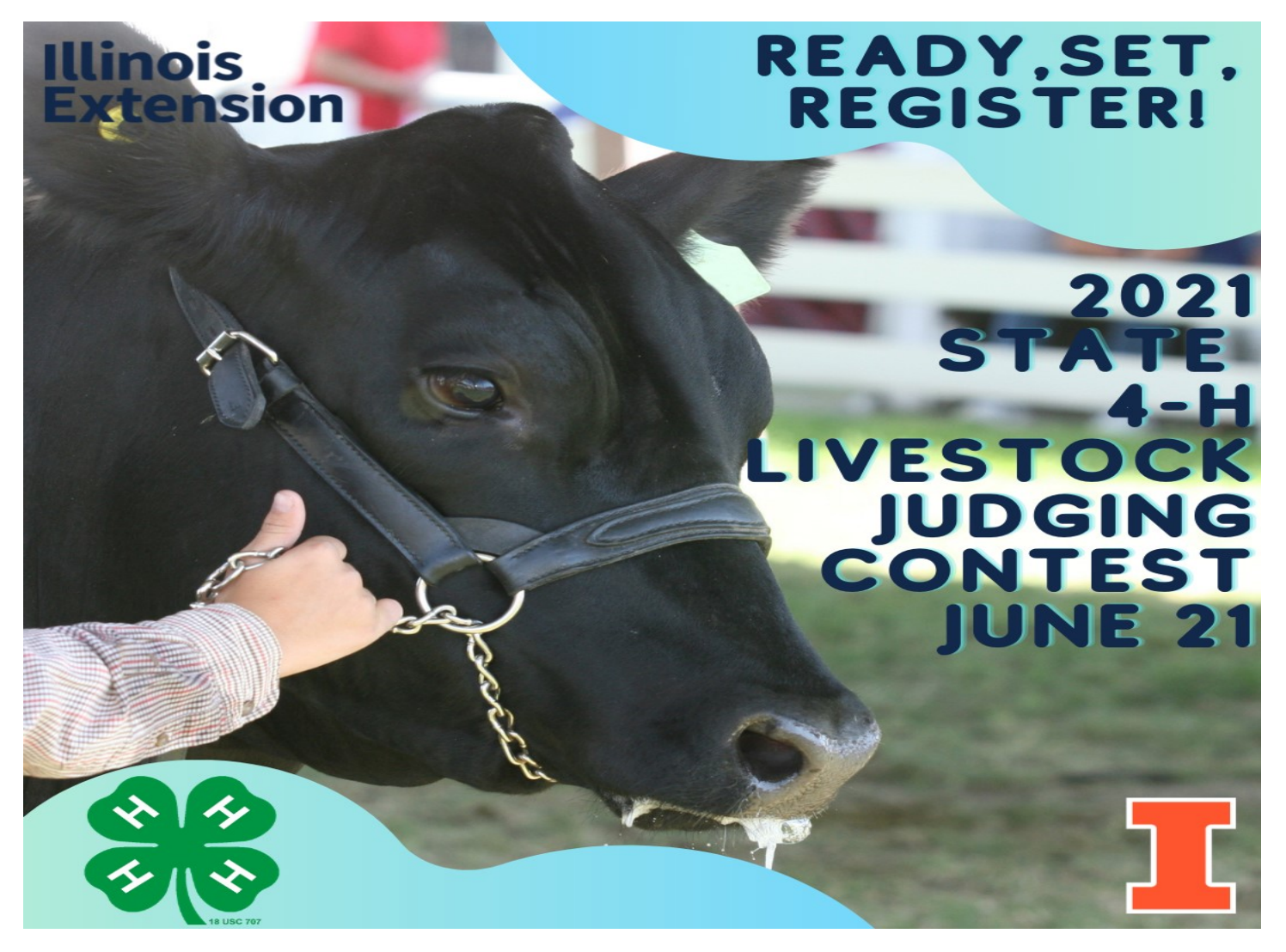
Registrations are NOW OPEN for the 2021 State 4-H LIVE-STOCK JUDGING CONTEST!!

The contest is being held June 21st at the Peoria County Fairgrounds. This event is open to 4-H members ages 8-19. Registration begins at 8:30 a.m., contest starts at 10 a.m. All participants must be there and checked in by 9:15 a.m.