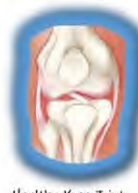
Healthy Knee Joint