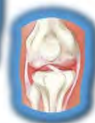
Knee Joint with Arthritis

Date: Thursday, March 26, 2020 Time: 1:00 PM - 3:00 PM