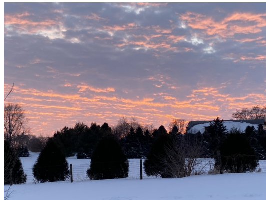
Last night's sunset taken from our back porch.

We will have a leader's meeting on February 17, 2021 at 6:30 pm via Zoom. Leaders, please check your emails for a separate email as I sent you some important 4-H meeting information guidelines today. I will send out the link for the meeting as it gets closer.