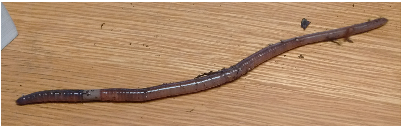
Fig. 1. An adult jumping worm that was submitted to an Illinois Extension office for identification.