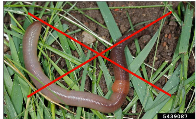
Fig. 3. Common earthworms, ( Lumbricus terrestris ) are a red-brown color with a raised clitellum.