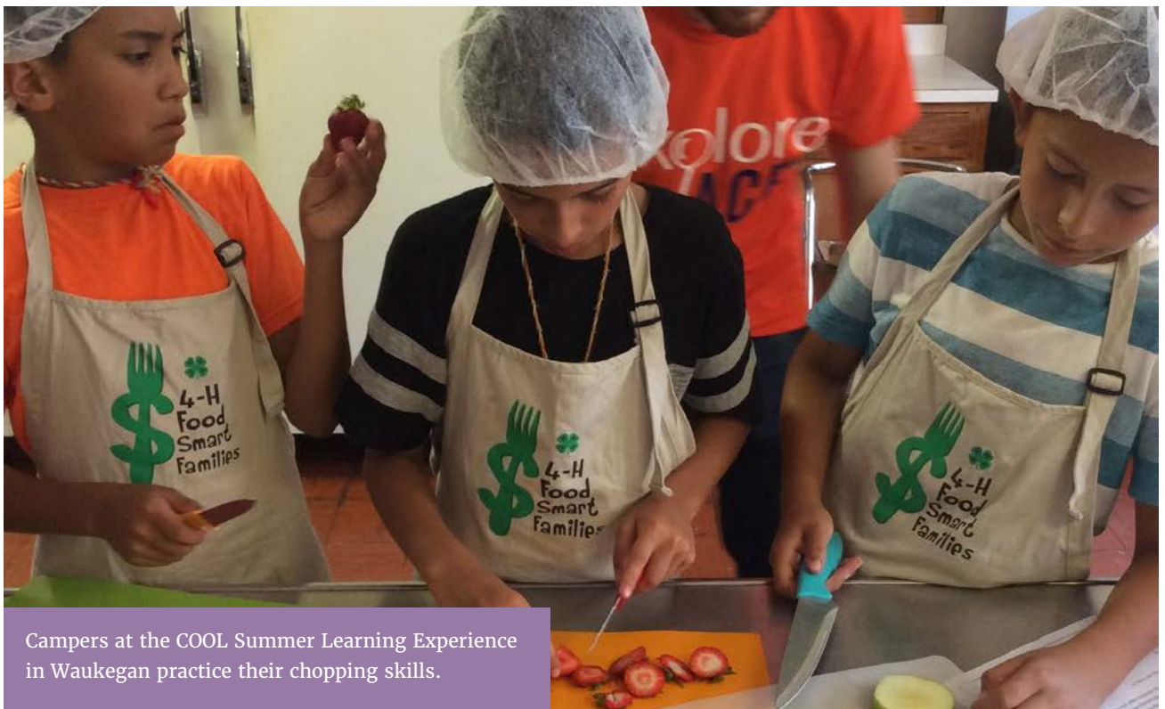
Campers at the COOL Summer Learning Experience in Waukegan practice their chopping skills.

help to ensure healthy habits in future generations while growing our leaders of tomorrow. To learn more about 4-H Food Smart Families or hosting a cooking school, one may contact their local University of Illinois Extension office.