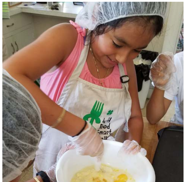
Youth practice mixing at the Illinois Junior Chef cooking school in Highland Park.

Running a program of this magnitude, across multiple counties has many challenges. However, the opportunity that a partnership between 4-H and SNAP-Ed provides our youth makes everything worthwhile. Programs such as 4-H Food Smart Families