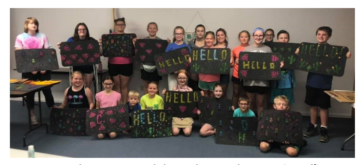
4-H Welcome Mat Workshop-July 10 at the Extension Office