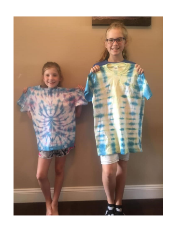
Tie-Dye Workshop at The MAC in Staunton-July 9