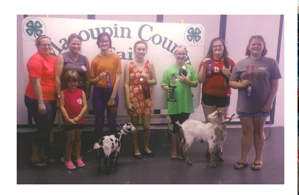
4-H Small Pets