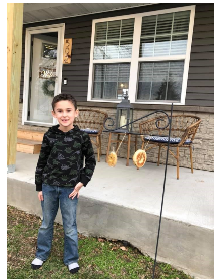
Great Work St. Jacob Cloverbuds!