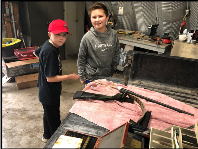
The Grant Prairie Shotgun Club is learning how to take care of their guns.