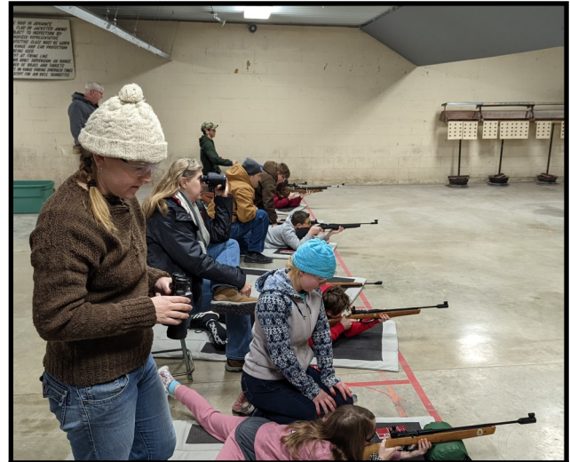
The Staunton Road Rangers practice at the Highland Pistol and Rifle Club when the weather is bad.