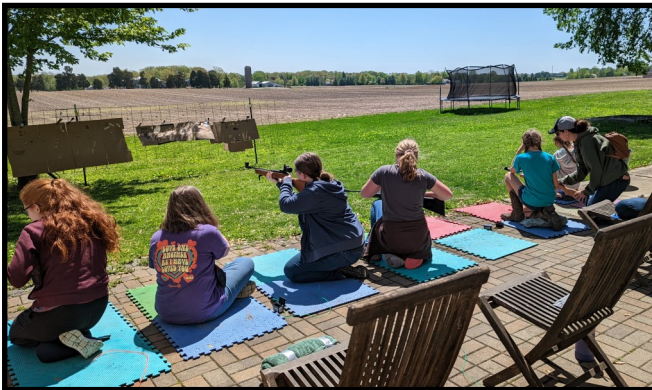
The Staunton Road Rangers are enjoying the beautiful May weather and practicing shooting their rifles at the Bremer family farm.

The Staunton Road Rangers have clear April skies to practice shooting their shotguns. Keep up the great work everyone! I suspect we will see some of these youth at the State shoots!