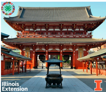
Travel Abroad Update!

Illinois 4-H Contact: Curt Sinclair at sinclair@illinois.edu