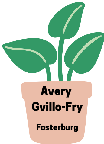
Avery Gvillo-Fry Fosterburg