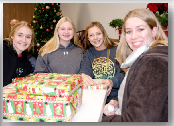
Grant Prairie 4-H members and their families wrapped Christmas gifts for their "Adopt a Family" recipient during their December meeting.