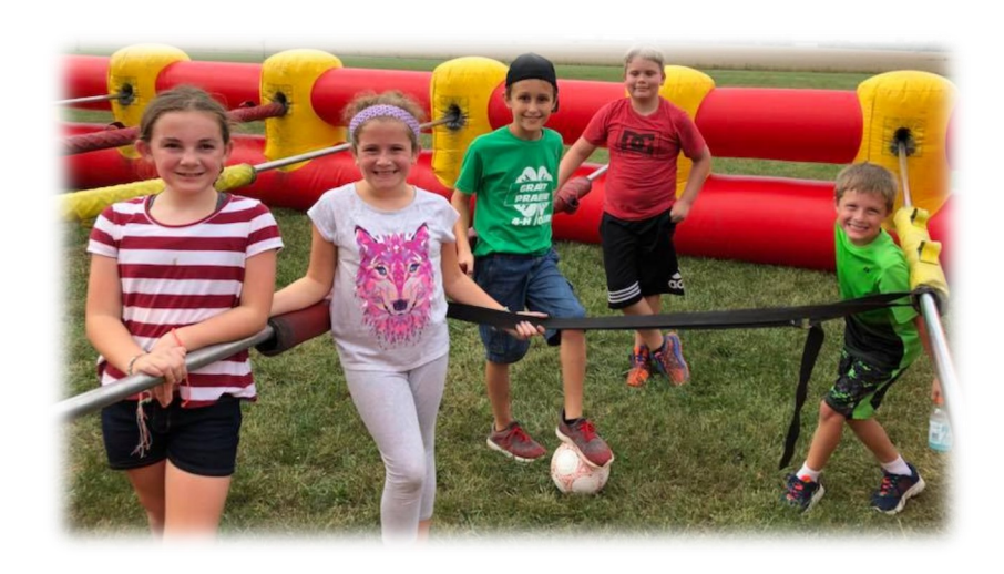
"To Make the Best Better"

The Grant Prairie 4-H Club had a Family Fun Day during National 4-H Week where all members, their families and one friend were invited to a meal and activities at the park. Activities included volleyball, kickball, an inflatable bounce house, human foosball, and a kids vs. adults softball game. (Pictured above and below).