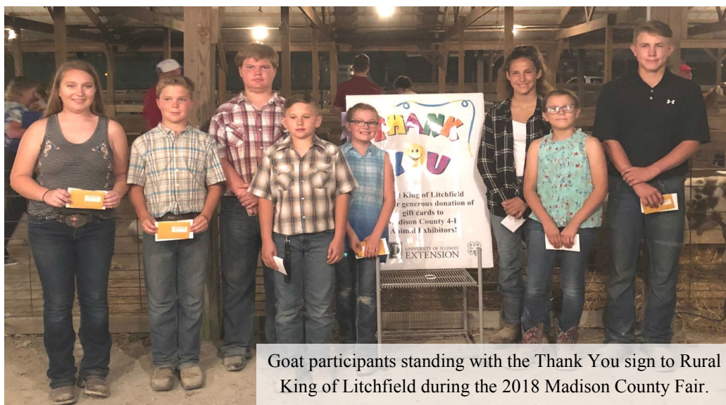
Goat participants standing with the Thank You sign to Rural King of Litchfield during the 2018 Madison County Fair.