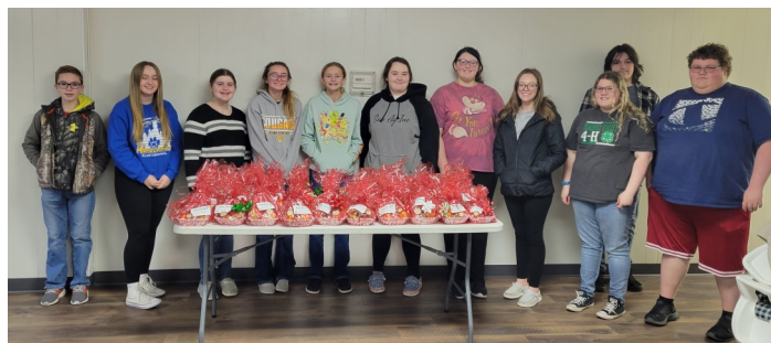
Above: Peaceful Valley 4-H Club made and delivered fruit baskets to local shut-ins, elderly, and bereaved.