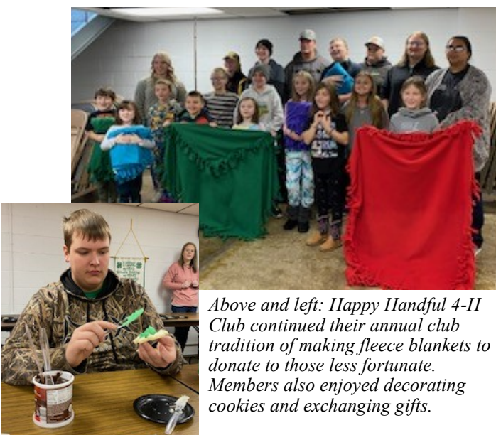
Above and left: Happy Handful 4-H Club continued their annual club tradition of making fleece blankets to donate to those less fortunate. Members also enjoyed decorating cookies and exchanging gifts.