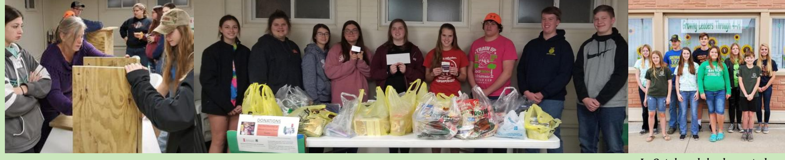
Mercer County 4-H Citizen Scientists work on their barred owl boxes.