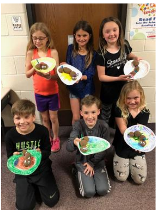
Students in Mercer County love their agriculture lessons!