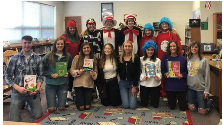
Sherrard High School students helped celebrate Dr. Seuss Day by reading stories with agriculture themes and leading activities to students at Winola Elementary and Sherrard Elementary.