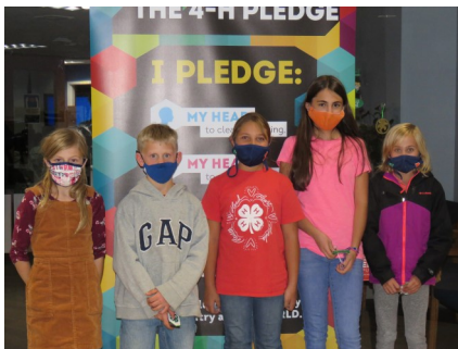
A few of the 2020-21 First Year Members