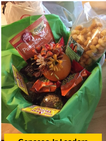
Geneseo Jr Leaders