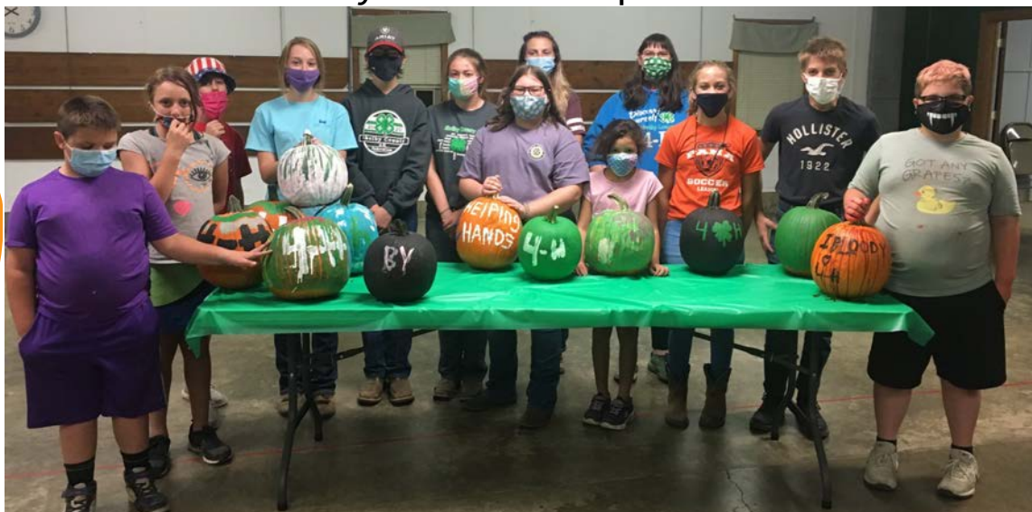
Silver Spurs 4-H members painted 4-H pumpkins as their October club activity. Everyone's pumpkins turned out great!